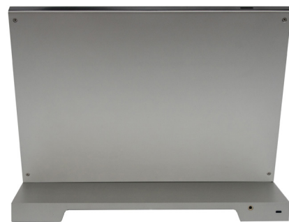
Rear view of Polycom MSR Dock