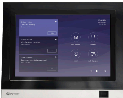
Front view of Polycom MSR Dock