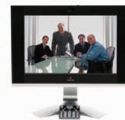
Polycom HDX 4000™