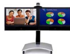
Polycom HDX 8000™