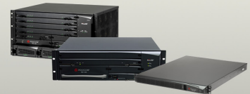
Polycom RMX® Series