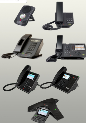
Polycom CX Series