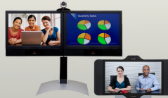
Polycom HDX® Series